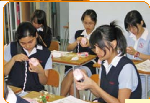
Making soap flower baskets