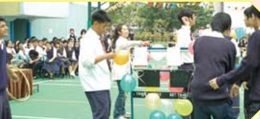
Pop the balloons!