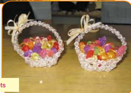
Beautiful fruit baskets