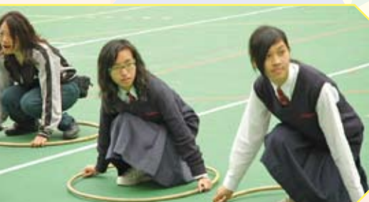
Ready, set, go!