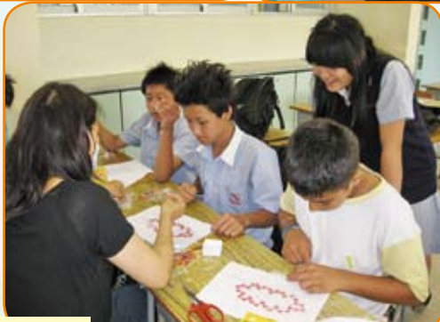
Making bead ornaments