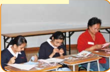
Embroidered telephone pouches